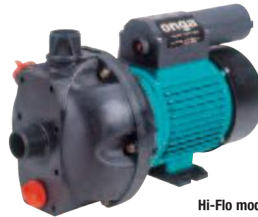
Hi-Flo model 112