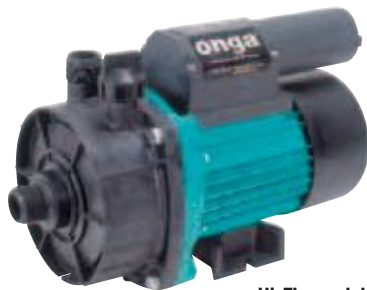
Hi-Flo model 413