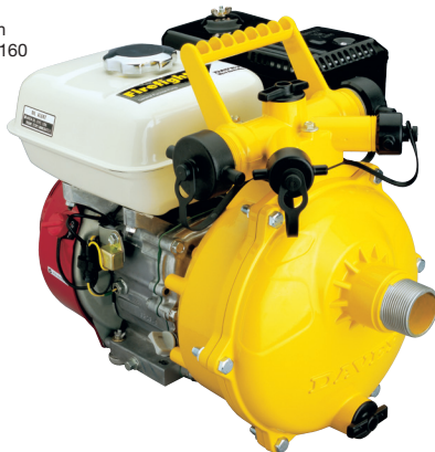
5155H with Honda GX160 Engine