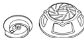
Cutter Type 'K' Series

Note: Cutter pumps are not suitable for sanitary products - use Grinder models.