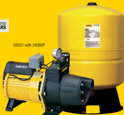
095S1 with 24060P