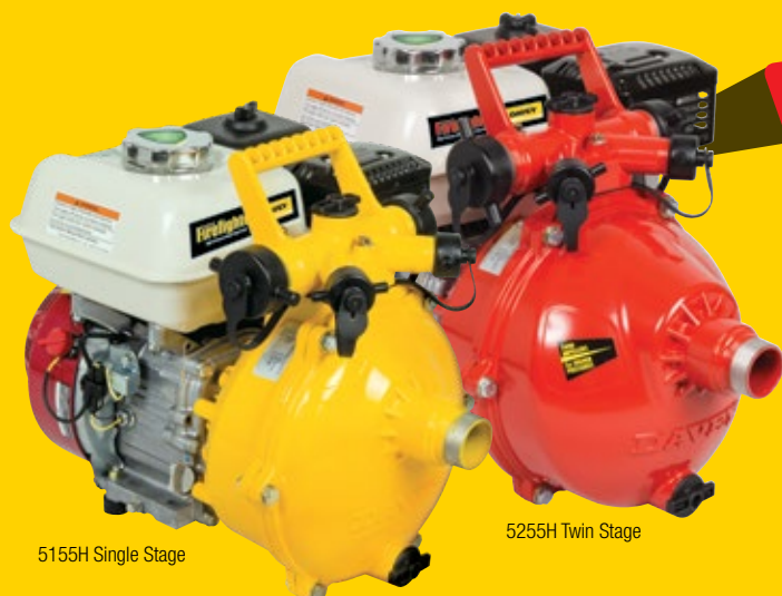
5155H Single Stage

Market leader in firefighting and water transfer.