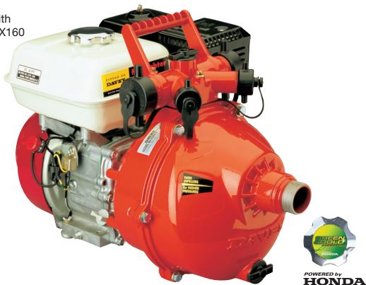
5255H with Honda GX160 Engine